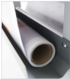
Front tray for prints (optional)

NEW New control panel design. New ergonomic position of the shafts for easy adjustments