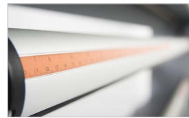
Millimeter scale on each shaft for the right positioning of the media