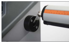
Three aluminum shafts with automatic locking system