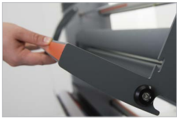
Swing-up steel feed table for quick set-up

Photosensitive cells with automatic self-control of safety devices and emergency buttons