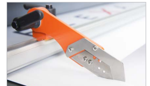
Rear table with cutting unit (optional)

Feeding control by hand (control panel) or foot pedal (hand free operation)